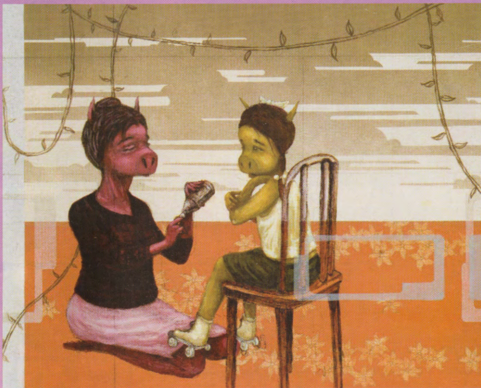
Kojo Griffin, Untitled (detail), 2004