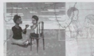
Cover: Kojo Griffin Untitled, 2004 Mixed media on wood panel, 35-7/8" x 59-7/8 x 2-3/4"

For BAMart information: 718.636.4101 / bamart@bam.org