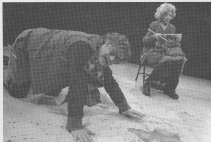
David Gordon & Valda Setterfield.