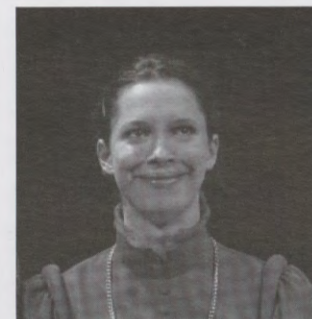
Rebecca Hall in As You Like It.