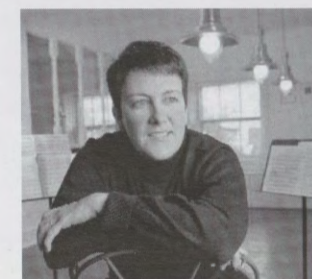
Jennifer Higdon, composer commissioned by the Brooklyn Philharmonic